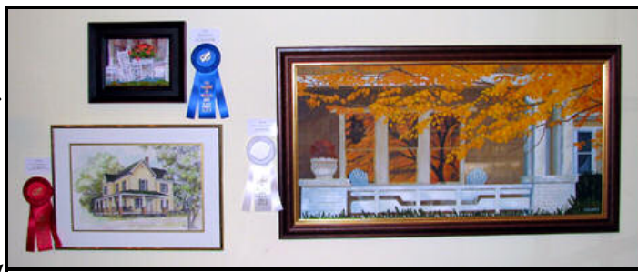
Winning artwork can be view in the Wendell Chamber Board Room